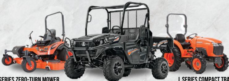
Z SERIES ZERO-TURN MOWER